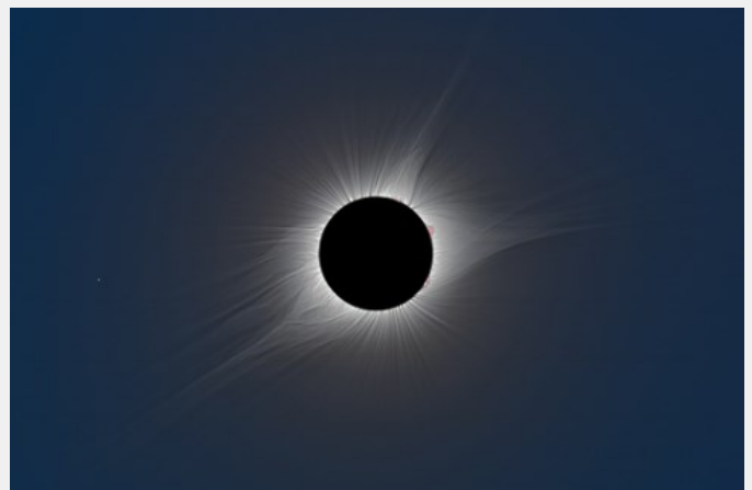
Photo is the total phase of the August 21, 2017, solar eclipse as seen from Madras, Oregon.